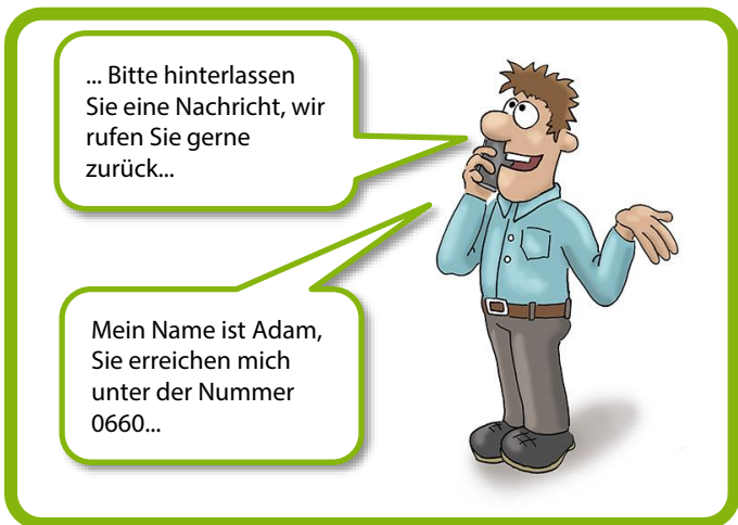
Some counselling centres can be difficult to reach when they are busy. If you only get to an automated answering machine, don't hang up! Leave a message to be called back or write an email.