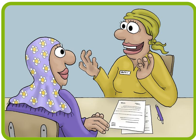
If German is not your mother tongue and you would like to speak to someone who knows your language, ask on the phone if this is possible when you make your appointment.

The counselling services are anonymous; aid organisations do not pass on any information about you to state agencies. Your name is only required when applying for financial assistance.